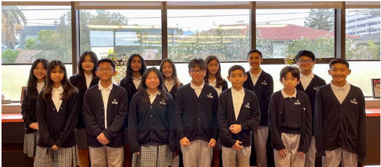
Student Council Commissioners: 2023 -2024

Dear God, Our Father Help us in our work and everyday life To respect one another And appreciate our faculty. Bless our parents and those who help the school. Thank you for the gift of life, which You have given us. Be with us and enlighten us as we join together as a school. We thank You for all You have given us, The happiness of being with our friends, And for helping us to grow in every way. Through Jesus Christ, Our Lord. AMEN.