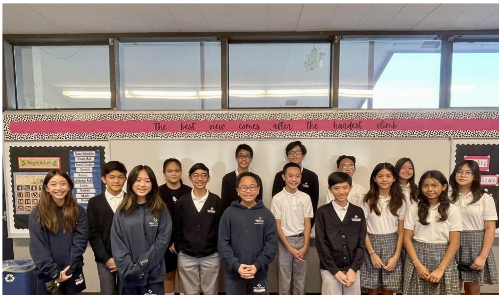
Student Council Commissioners School Year 2022 -2023

Dear God, Our Father Help us in our work and everyday life To respect one another And appreciate our faculty. Bless our parents and those who help the school. Thank you for the gift of life, which You have given us. Be with us and enlighten us as we join together as a school. We thank You for all You have given us, The happiness of being with our friends, And for helping us to grow in every way. Through Jesus Christ, Our Lord. AMEN.