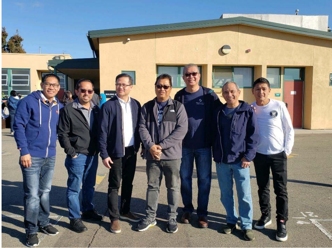
ALA moms and dads - in support of the team's San Diego academic competitions!