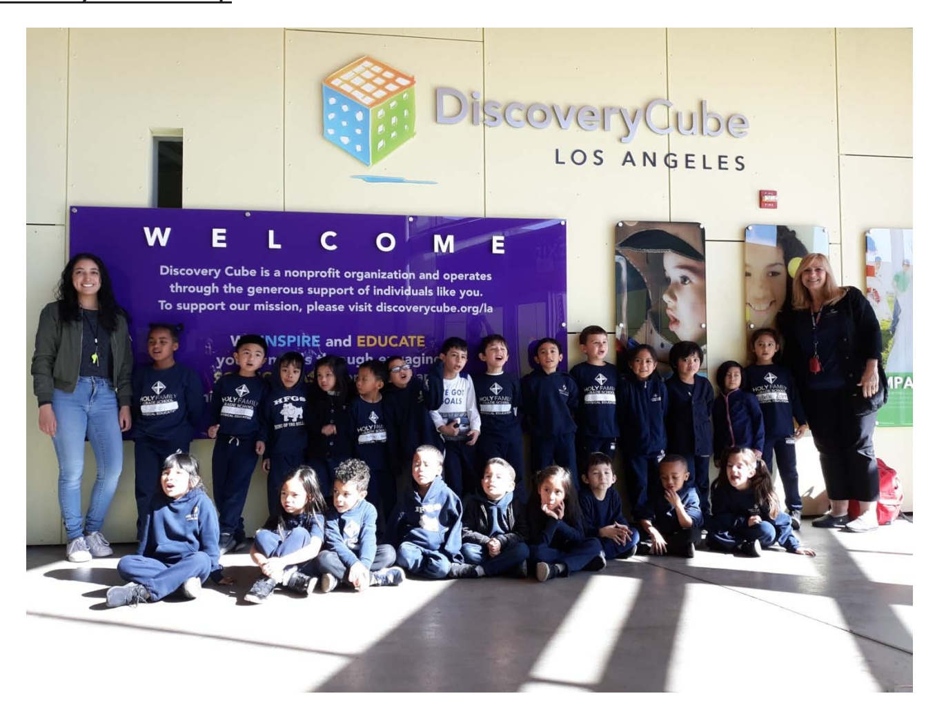
Exploring condensation and evaporation at the Discovery Cube